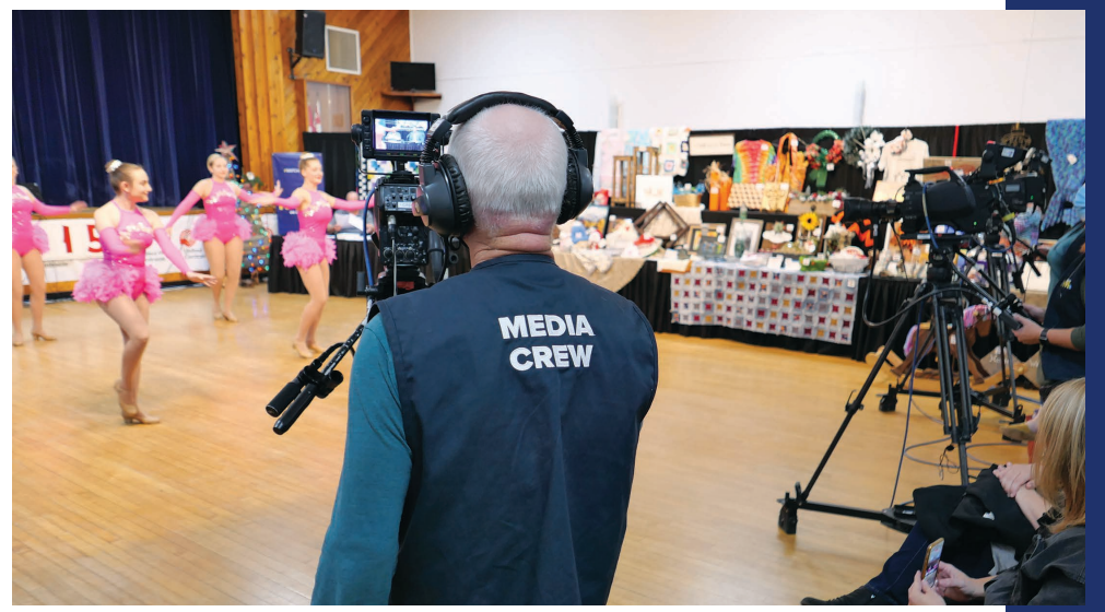
Pictured: AccessNow TV covering the 2021 United Way of Estevan Telethon.