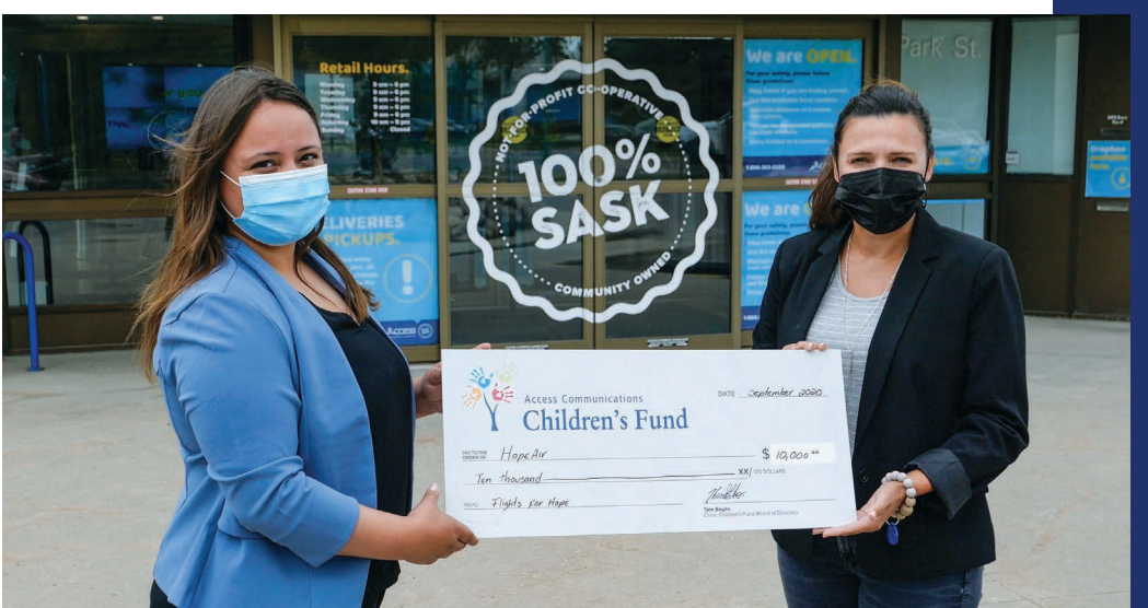
Pictured: Children's Fund cheque presentation to Hope Air.