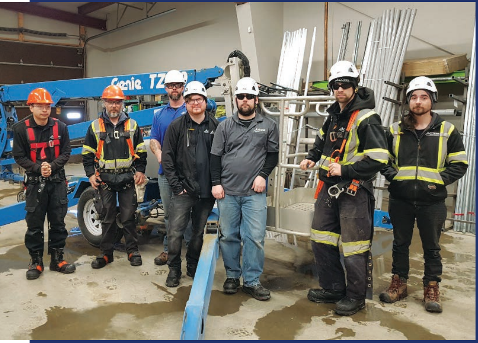
Pictured: Lift safety training session with our rural wireless technicians.

Our rural network not only supports internet, but other important services needed on farms, businesses, cabins, and homes – including television, phone and security services.